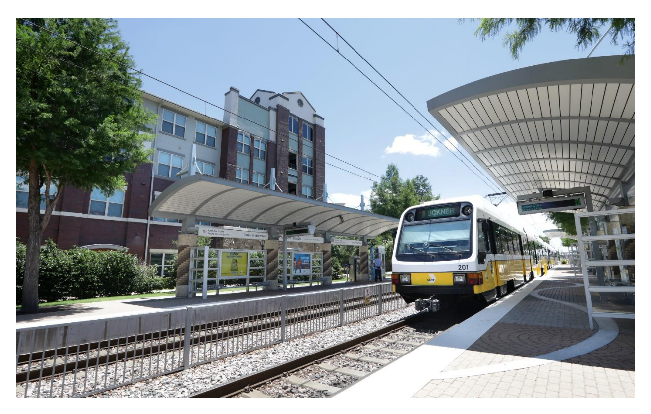
Each month, we will spotlight a city in the DART Service Area and the service that DART provides.

Farmers Branch is along the I-35E Stemmons Freeway corridor in the northwest corner of the DART Service Area. The city has retained its small-town feel while offering direct big city access, an extensive parks system, a strong business community, and a growing restaurant scene.