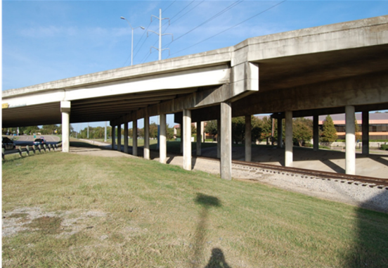
Intersection of Preston Road (elevated structure) and Keller Springs Road, looking east