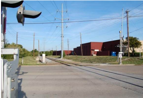
Figure 4-19 Cotton Belt Alignment East of Knoll Trail Drive