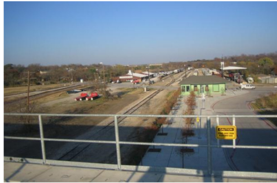
Downtown Carrollton DART LRT Station, looking east

Section 2B, extending from Kelly Boulevard to the Dallas North Tollway, features primarily large-scale industry along the south side of the track alignment to the Carrollton and Addison city limits (these developments extend southward to beyond Belt Line Road). Smaller sized industrial parcels extend to the freight track interchange south of the Addison Airport. Along the north side of the track alignment, east of Kelly Boulevard, are the Honors Golf Club (formerly the Columbian) and single-family, as well as multi-family, residential developments. The area between Surveyor Boulevard and the Addison Airport is medium-scale industrial development. The landscape changes abruptly and dramatically east of the airport and Addison Road. Here, the track alignment and proposed Addison Station are located in the midst of a densely populated urban center comprised of upscale, high-rise, residential, commercial, and office buildings, as well as numerous hotels, eateries, entertainment venues (WaterTown Theatre, for example), and parks (refer to Figure 4-8 ). The Cotton Belt Corridor passes under the elevated Dallas North Tollway, as the area transitions visually to almost exclusively multi-story office buildings.