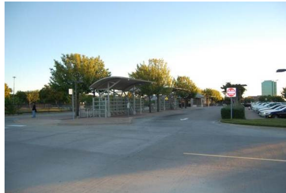
Figure 4-12 Addison Transit Center Bus Parking Island