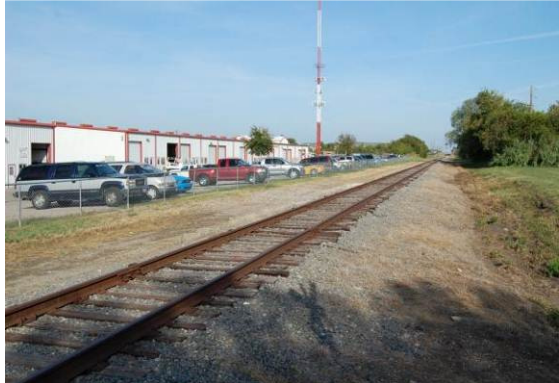
Track crossing at Dickerson Street, looking northeast