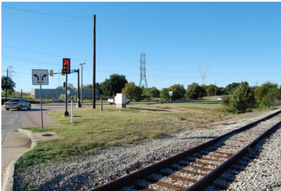
Figure 4-3 Mockingbird Lane/Belt Line Road Looking South