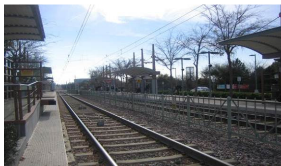
Red Line LRT side platforms, looking south