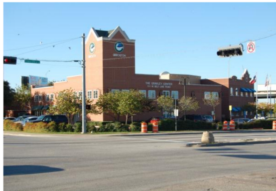
Intersection of Main Street and Belt Line Road, looking south

Downtown Carrollton Station: The Downtown Carrollton Station center platform would be located along the existing freight rail track alignment immediately north of the recently constructed Downtown Carrollton LRT Station and east of the aerial DART Green Line LRT Station and west of Denton Drive (refer to Figures 4-6 and 4-7 ).