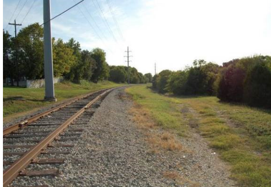
Proposed Preston Road Station location, looking east