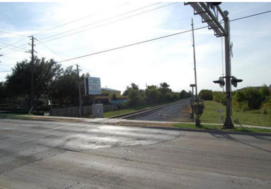
Track crossing at Coit Road, looking west