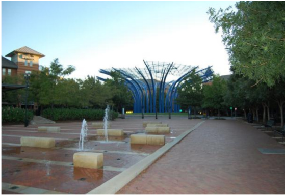
Addison Circle plaza and water feature, looking east