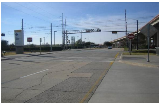
Red Line LRT track crossing at elevated PGBT, looking west