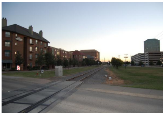
Track crossing at Quorum Drive, looking east

Addison Station: The Addison Station side platforms would be located along the Cotton Belt Corridor rail alignment adjacent to the existing Addison Transit Center, between Addison Road and Quorum Drive, in the Town of Addison. The station area is surrounded by mixed-use developments—notably Addison Circle and Addison Circle Park, immediately north of the track alignment, with its extensive