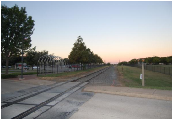
Track crossing at Quorum Drive, looking west