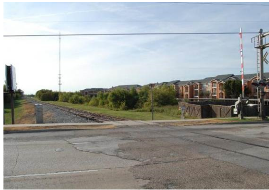
Track crossing at Coit Road, looking west