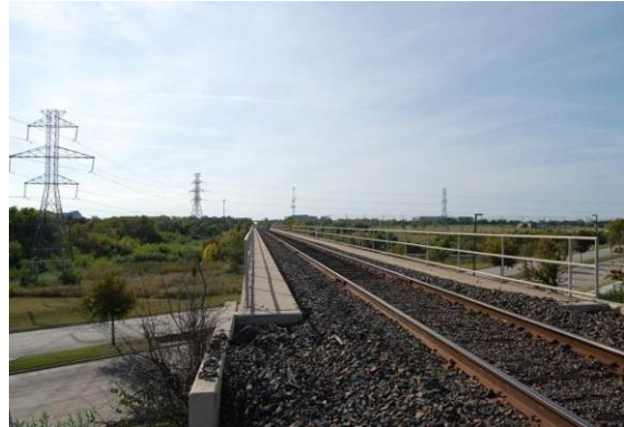
Figure 4-24 Cotton Belt Alignment West of West Renner Road

12 th Street Station: The 12 th Street Station side platforms (north alignment option) would be located along the existing freight rail track within the Cotton Belt Corridor, adjacent to 12 th Street, between the aerial DART Red Line LRT Station and southbound Municipal Avenue. The station area is in the City of Plano. This area is mixed use including small single-family residences, light industry, and local businesses, such as Plano Marine on the southern edge of downtown Plano. The dominant visual feature near the station area is the DART Red Line elevated LRT guideway (refer to Figures 4-25 and 4-26 ).