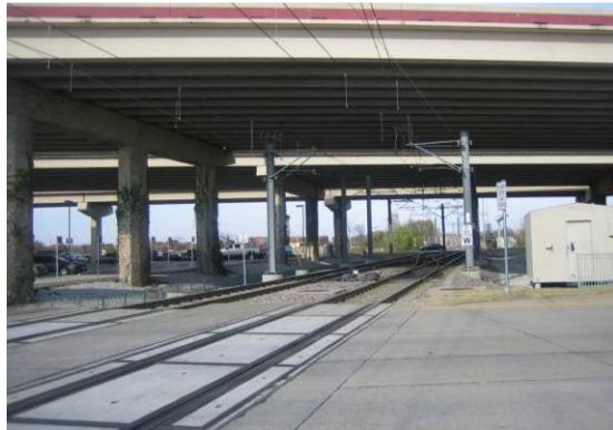
Red Line LRT track crossing at elevated PGBT, looking north

Bush Turnpike Station: The Bush Turnpike Station (at-grade) side platforms would be located along an alternate proposed south track alignment adjacent to the existing, at-grade Bush Turnpike LRT Station, in an existing and visually complex transit station environment (refer to Figures 4-28 and 4-29 ).