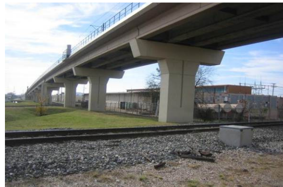
Track crossing at Red Line LRT guideway, looking south

Section 3B – Alternate South Alignment Option: Approximately one-quarter mile west of the US 75 , the Red Line Interface South Alternative veers southeastward to pass over US 75 (south of the PGBT