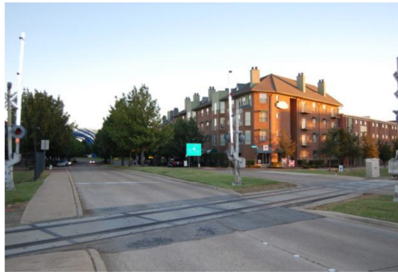
Track crossing at Quorum Drive, looking northeast