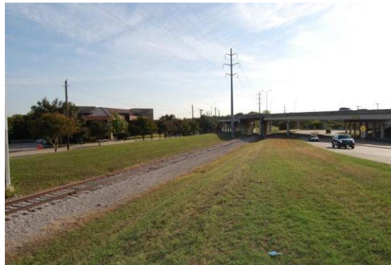
Keller Springs Road and the Fairhill School, looking west

Renner Village Station: The Renner Village Station side platforms would be located east of the at-grade crossing at Dickerson Street. Immediately adjacent to the station can be seen a single-story commercial/light industrial building to the north (refer to Figure 4-22 ) and small single-family residences to the south.