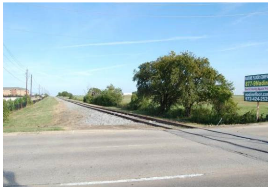
Track crossing at Coit Road, looking east