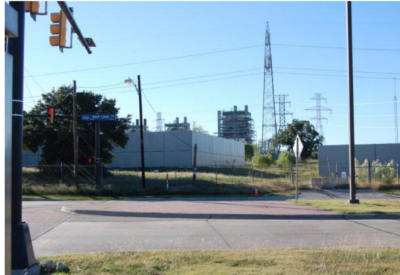
East Belt Line Road, looking south

North Lake Station: The North Lake Station side platforms would be located along the Cypress Waters Alternate, between the northwest shore of North Lake and East Belt Line Road at the Beltline Trade Center, within the City of Dallas. The aforementioned electrical power station is located immediately east of the station area (refer to Figure 4-3 ). The environs of Grapevine Creek and East Belt Line Road, primarily north of the track alignment, are heavily wooded and the trees block from view the single-family residences to the north (refer to Figure 4-4 ). This area is comparatively flat, with little natural spatial and visual variation. Here, the prominent features are power poles and the electrical substation.