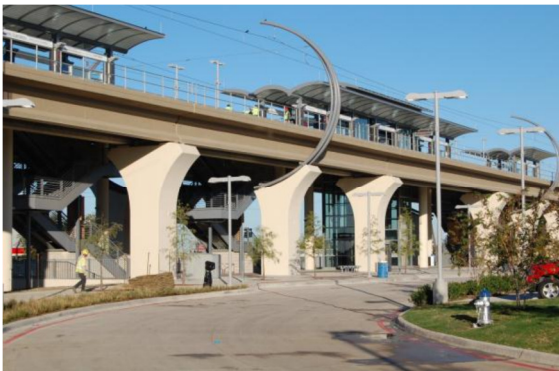
Downtown Carrollton DART LRT Station, looking northwest