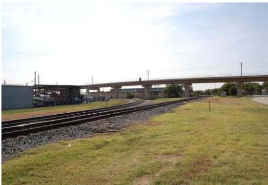
Proposed 12 th Street Station location, looking west toward LRT Red Line guideway