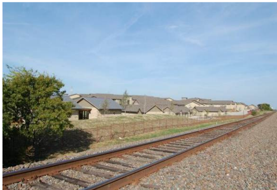
Track crossing at West Renner Road, looking northeast